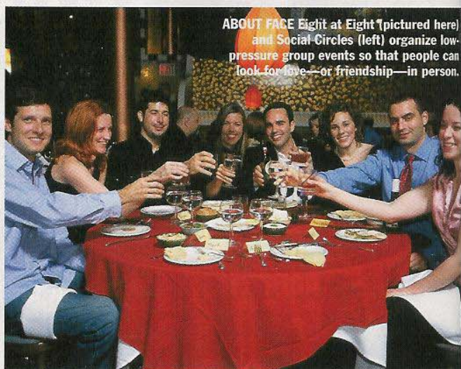
ABOUT FACE Eight at Eight (pictured here) and Social Circles (left) organize low-pressure group events so that people can look for love—or friendship—in person.